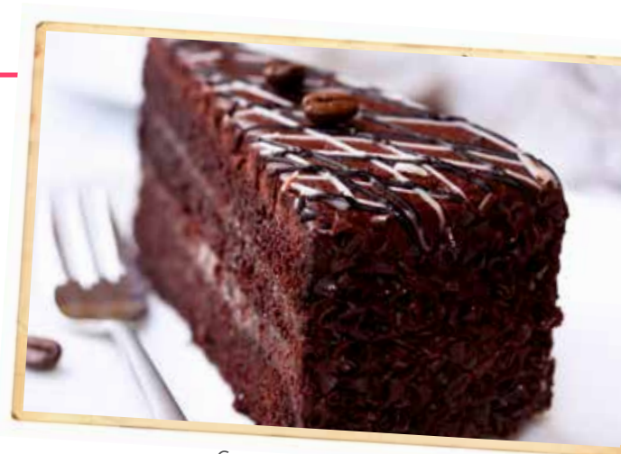
German Chocolate Cake

Preheat oven to 350 degrees. In a small bowl combine flour, hempseed, cacao, salt and baking soda. In a large bowl using an electric hand mixer, blend eggs, Pure Monk sweetener, butter and vanilla. Add dry ingredients into large bowl and blend until fully incorporated. Butter two 9-inch round cake pans and dust with coconut flour. Pour batter into pans and bake at 350 degrees for 35-45 minutes. Remove from oven, allow to cool completely then remove from pans. Frost (see recipe on pg. 13) and serve.