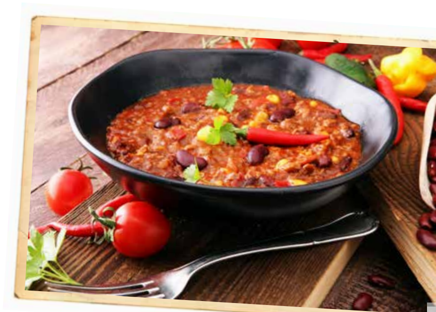
Peppy Cowboy Chili

Heat oil on medium heat in large pan or Dutch oven. Sauté beef, onions and garlic until browned. Mix in tomatoes, coffee, tomato paste and beef broth. Stir in spices, mushrooms and chilies. Reduce heat to low and simmer on stove top for 1 1/2 hours, or place in slow cooker and cook on low for 6-8 hours. Top with cilantro. Freezes nicely.