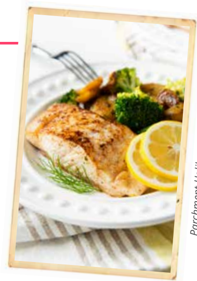
Parchment Baked Halibut with Lemongrass

Tip: If fish fillets are 3/4 to 1 inch thick, increase baking time to 20 to 25 minutes.