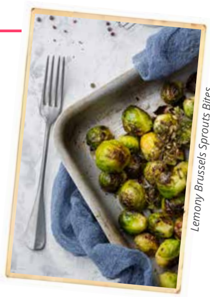
Lemony Brussels Sprouts Bites