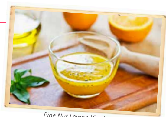
Pine Nut Lemon Vinaigrette

Whisk all ingredients together until thoroughly combined.