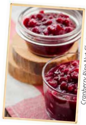
Cranberry Pine Nut Chutney