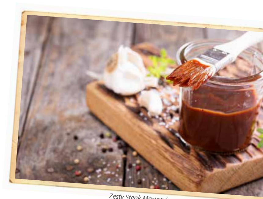
Zesty Steak Marinade

Note: Make sure not to use fresh ground coffee beans because your marinade will be overly strong in coffee flavor. Save 2 tablespoons of coffee grounds from making your morning brew.